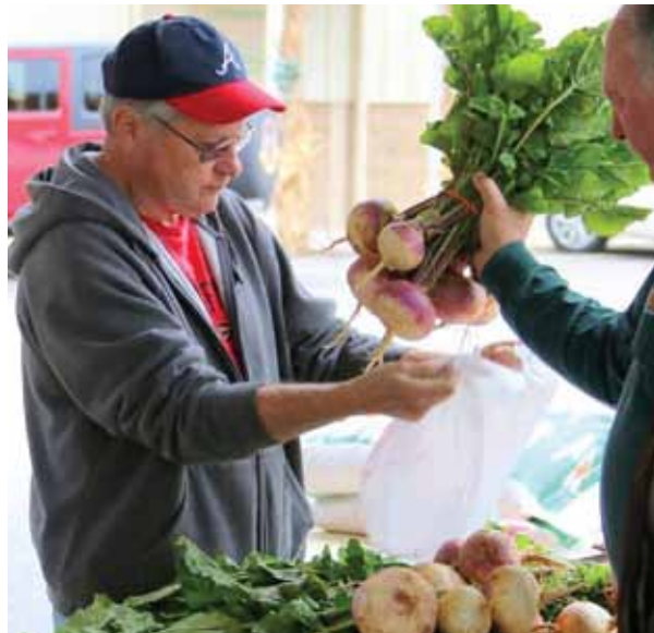
Farmer's Market